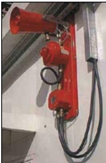
Example of installed combination unit