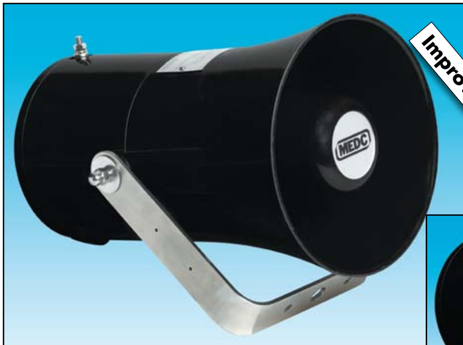
20W & 15W (Long Flare)