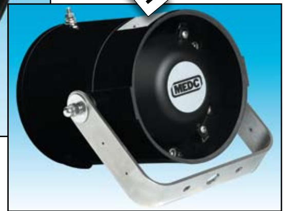
8W (Short Flare)