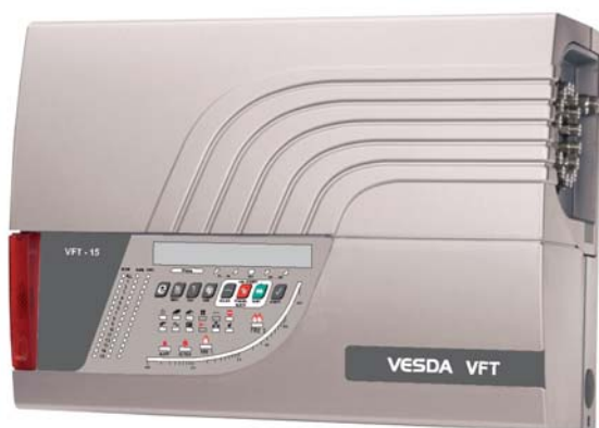
Xtralis VESDA VFT